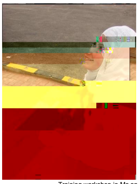
Training workshop in Ma an

The main implementation problems were difficulties in communicating with areas outside of Amman, and the inability of the project to engage Jordanian youth from Palestinian origin who were frustrated by their social and political conditions. The work plan was implemented more or less as planned and the project met or exceeded its anticipated outputs. JCESS made a guick switch when it found it would take months to work out a memorandum of understanding with public universities to have activities on campus, and thus reverted to