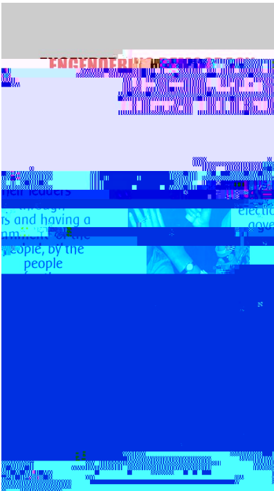
Banner with UNDEF emblem