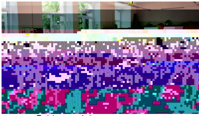
Training on website Cherkasky CVU Photo

The use of a concept that had already been piloted by Cherkasy CVU