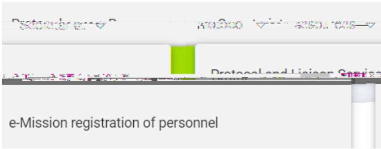
5. " e-Mission registration of personnel"