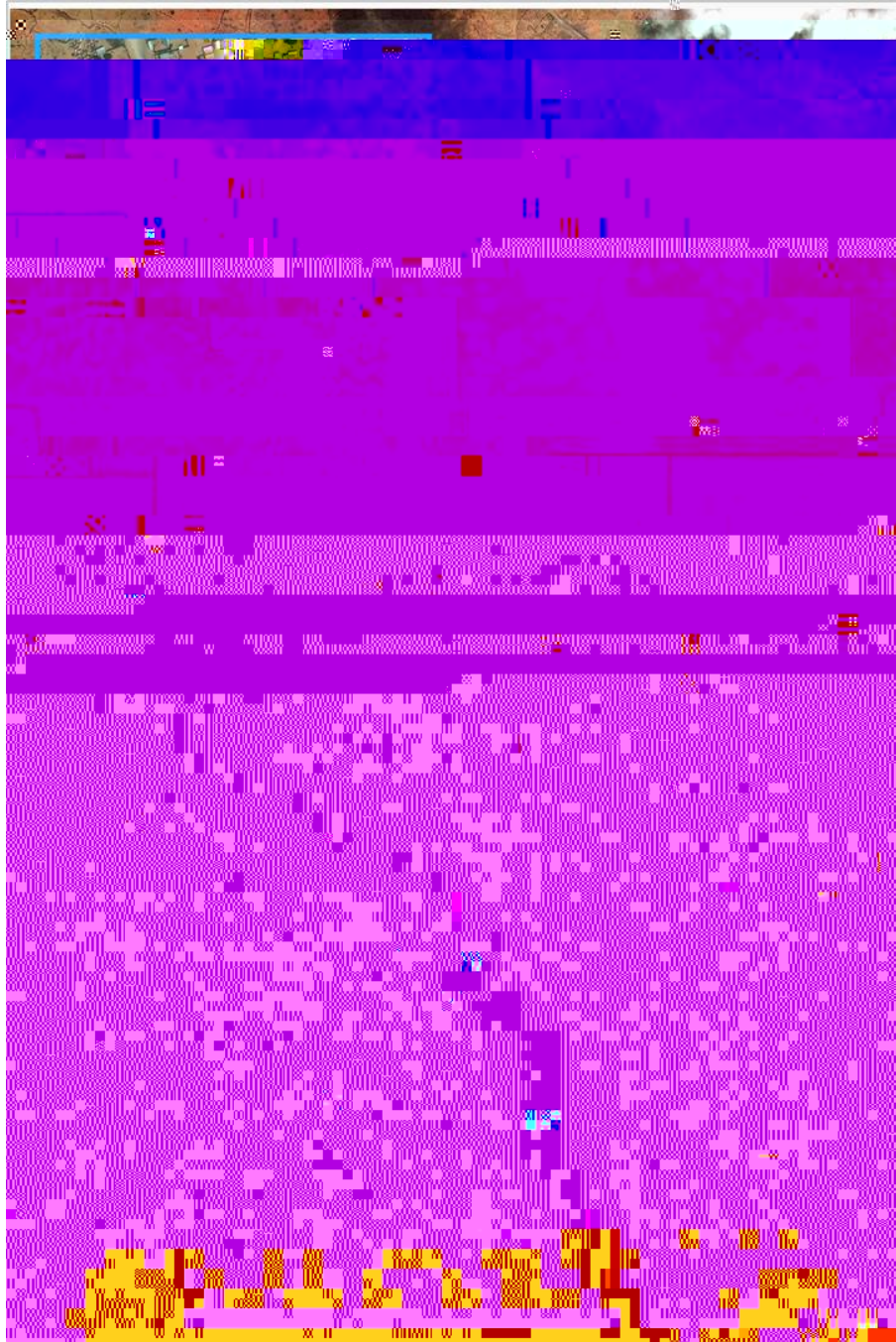
Figure 6: Overview of key stockpile locations in Kismayo, Lower Juba, Somalia.