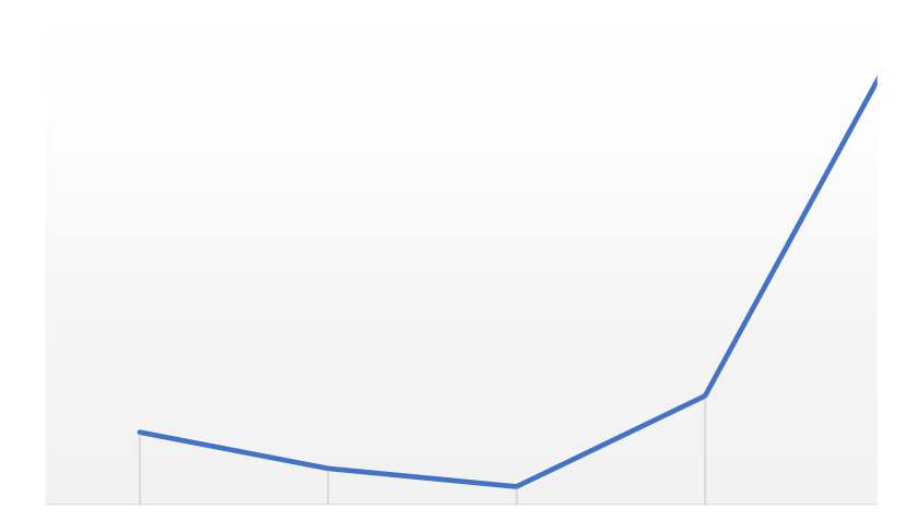
Fki wtg III Briefings to the Peacebuilding Commission by women peacebuilders since 2016